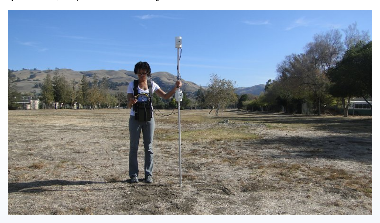
G-857 in use as a gradiometer with integrated GPS.

The G-857 provides a reliable, low cost solution for a variety of magnetic search and mapping applications. Single key stroke operation means the G-857 can be operated by non-technical field personnel or used in teaching environments. The G-857 uses the well-established proton precession method, allowing accurate measurements to be made with virtually no dependence upon variables such as sensor orientation, temperature, or location. The unit provides a repeatable absolute total field magnetic reading. The unit offers new features such as GPS time synchronisation, GPS positions and in-field navigation with a hand held Garmin GPS.