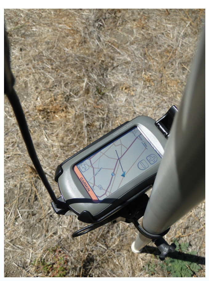
Gramin navigation display.