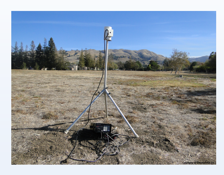
G-857 setup as a base station magnetometer for monitoring diurnal corrections.