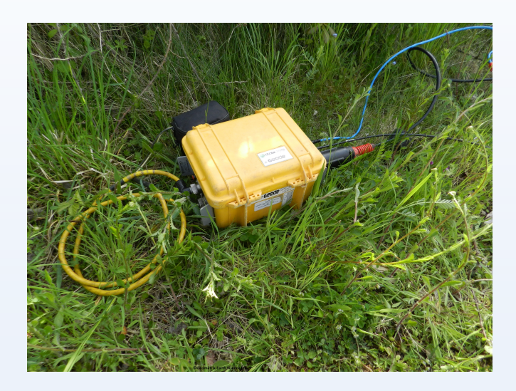
Typical field set up