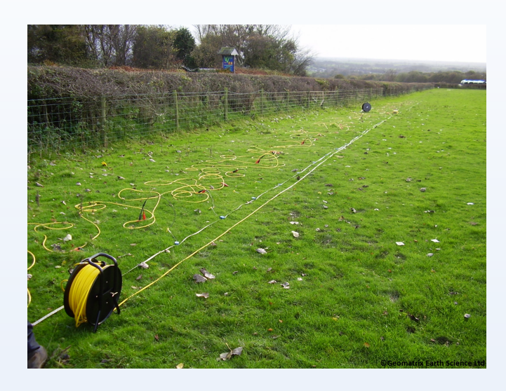
48 channel Geode system for MASW