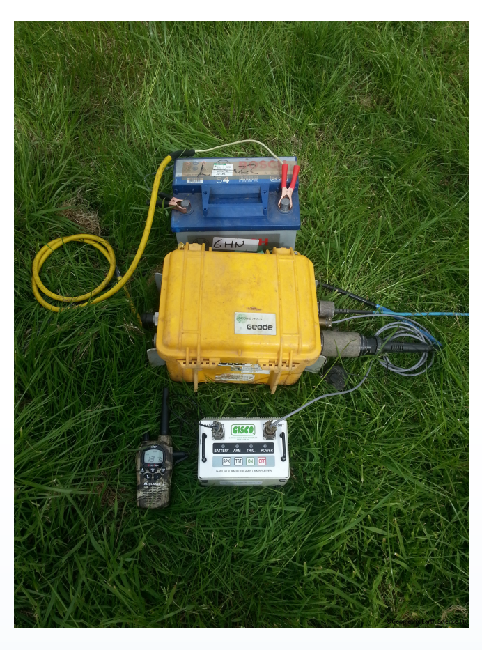
Geode configured with the Gisco radio trigger.