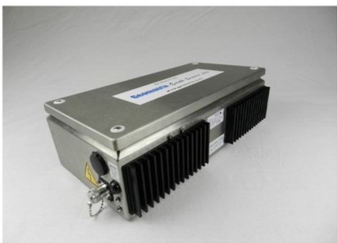
Mag Array Telemetry wet end unit and top end power supply.

The top End power/data unit has been designed with reliability in mind. No bells and whistles, just simply plug the system into a 240v (optional 110V) mains supply and switch it on. LEDS on the front panel indicates if the top end unit is operating correctly.