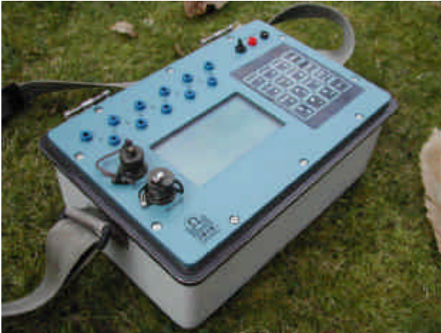
ELREC Pro unit with its graphic LCD screen