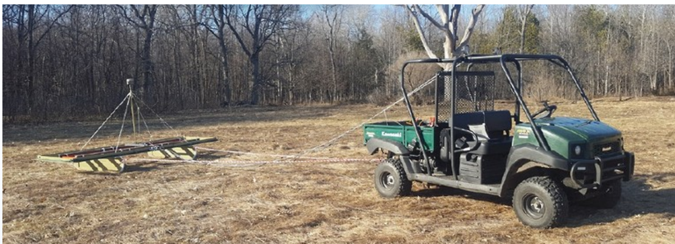
Fig.1. Showing the typical survey set up and tow vehicle arrangement of the EM63 Flex

Ferrous and non-ferrous metallic targets will have a greater response due to the high power of this system enabling the user to detect objects with high precision and enhance the probability of detection. For example, a 60mm mortar shell can be detected to a depth > 95cm and a larger target to a maximum depth of 6m beneath the sensor (depending on the site conditions).