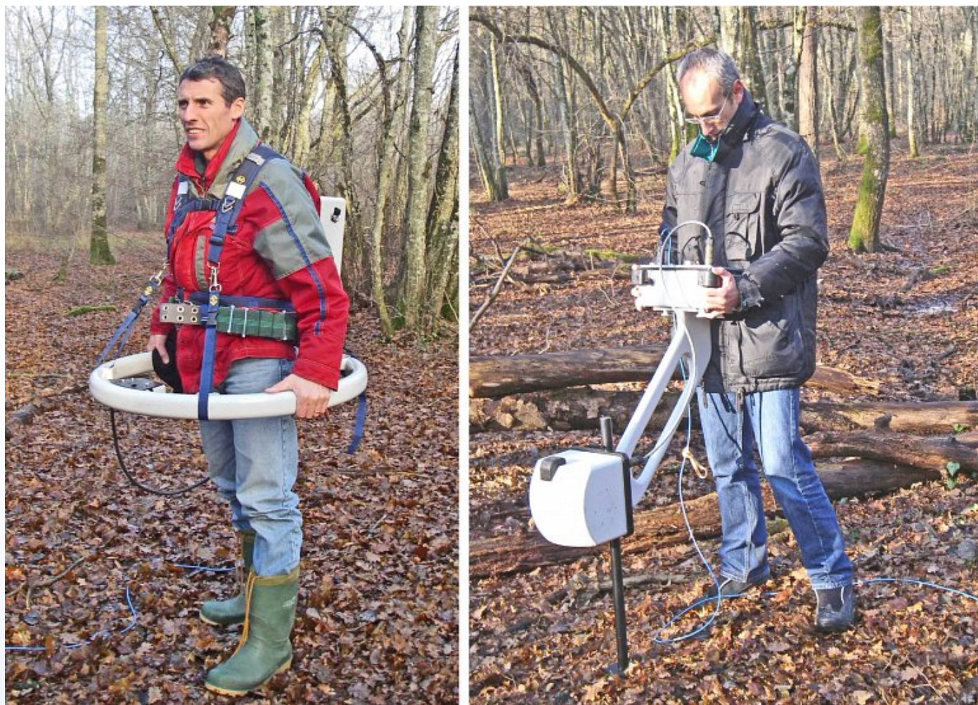
The PROMIS Transmitter coil (left) and 3 component receiver (right) in operation.

The Promis is a modern implementation of the Slingram technique which uses a coil to produce a primary magnetic field, this is linked by a cable to a receiver sensor at distances between 20 and 200m. The receiver coil measures 3 in-phase components and one out of phase component of the secondary magnetic field induced by ground conductors. Traditional Slingram type techniques only measure the vertical component of the magnetic field, but by measurement of the two additional horizontal components the Promis is able to give information on the strike of any conductive structure that has been intercepted. Penetration depths are determined both by Tx-Rx coil separation and frequency recorded but a rule of thumb is penetration is approximately 1/2 of the inter-coil separation.