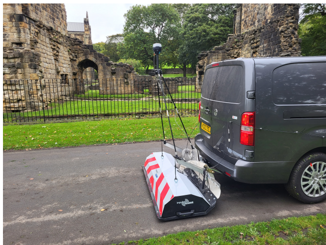
Raptor at Kirstal Abby, Leeds, Yorkshire