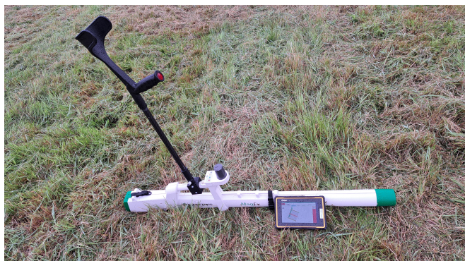
MagEx with carry handle and Getac tablet