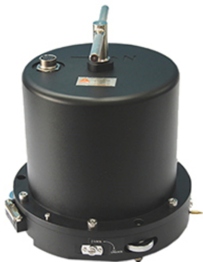
151B with carry handle.

The instruments internal structure, contains three independent mechanical sensors, one vertical and two horizontal (Vertical, N-S and E-W orientations), which are orthogonally mounted on the circular base. The Observer has facilities which allow you to mass lock/ unlock the sensor without opening the seismometer, and a built-in levelling system. The instrument can be levelled using the two external bubble levels, three adjustable feet and three locknuts, which are located on the seismometer's chassis (Fig. 1).