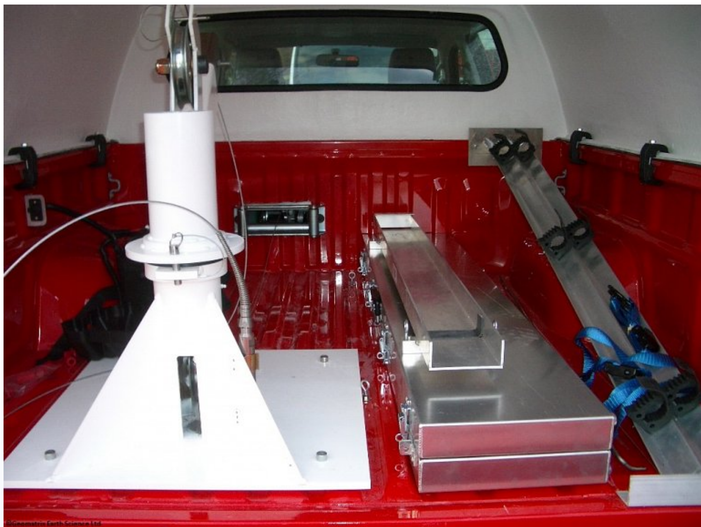
Integrated Mount Sopris Borehole Logging system with adjustable boom, winch, probe storage and work station.