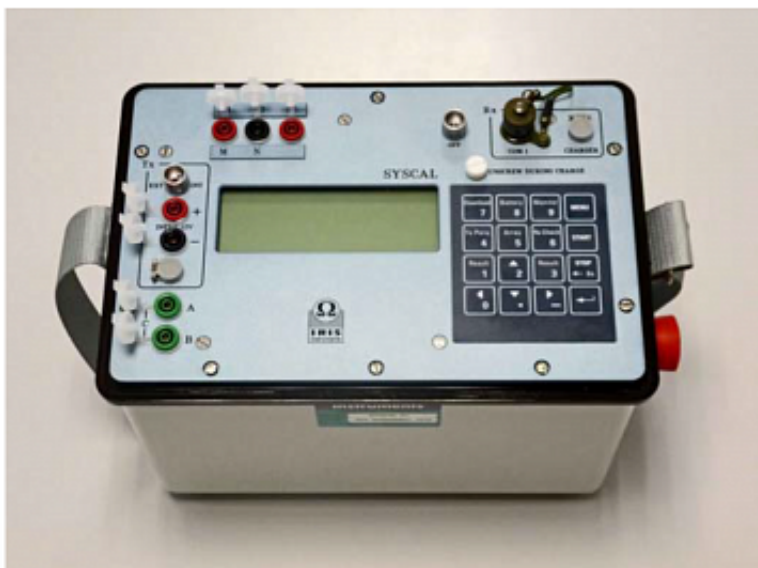
Syscal Junior console

The Syscal Jr is an all-purpose resistivity imaging and sounding system for environmental applications. The system can be supplied as a standard sounding system capable of recording two measurements simultaneously, perfect for performing offset Wenner sounding arrays. The second recording channel significantly improves data acquisition time when the instrument is fitted with internal switching board for 48 (Switch-48) or 72 (Switch-72) electrodes for Electrical Resistivity Tomography (ERT).