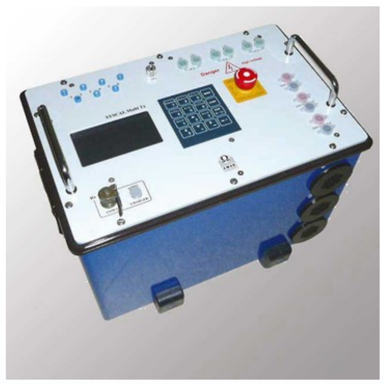
Syscal Multi-Tx resistivity and IP meter.

The Syscal Multi-Tx resistivity and induced polarisation meter is one of the latest developments by Iris Instruments. It features three 250W transmitters and 6 reception channels to reduce the acquisition time. This technology is based on the CDMA coding of the injected currents, enabling the computation of the contribution of each transmitter on the total voltage received on each channel. In other words, in one injection, the multi-Tx is able to perform 18 resistivity and chargeability measurements with accuracy comparable to the Syscal Pro/R1.