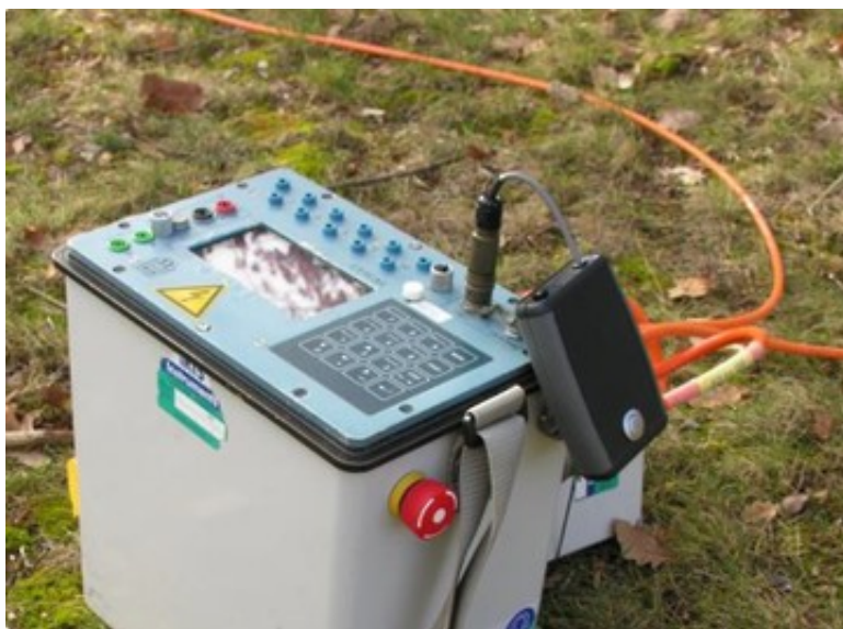
Syscal WiConnect connect to a Syscal Pro.

The WiConnect device allows a wireless connection from your tablet, smartphone or laptop. Perform a Rs-Check, choose your sequence and start, stop, pause the acquisition or check the data quality from the comfort of any shelter located around your Syscal/Elrec. With the WiConnect device, download automatically your data. Save it to your cloud server or email it to your office for faster reporting. The WiConnect device allow to control and dowload data from a webpage and can be used from any plateform (Windows, Android, Apple, Linux) and any device featuring a Wi-Fi connection.