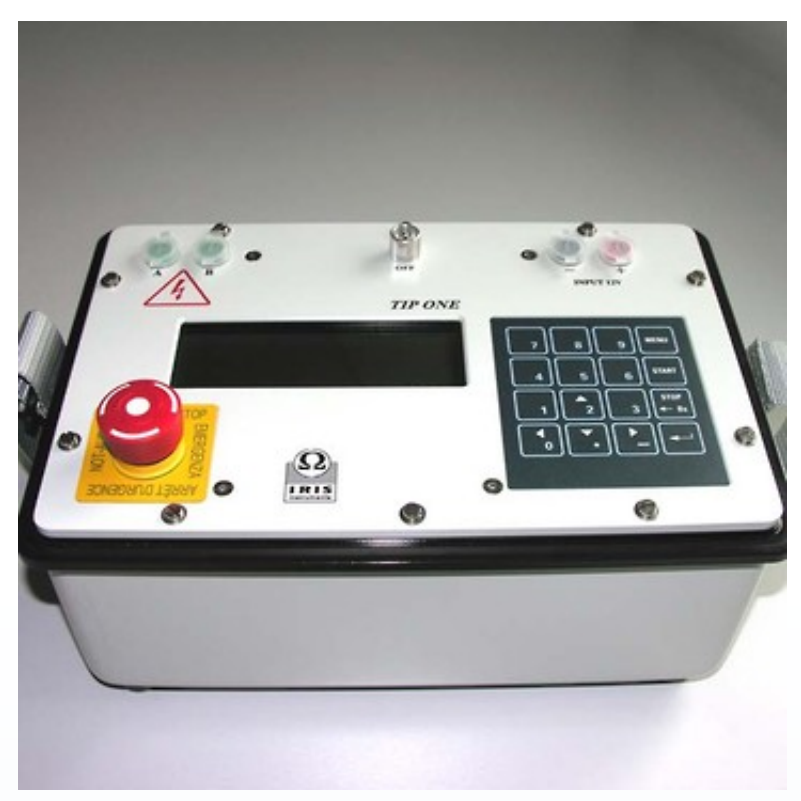
TIP One transmitter.

The TIP One is specifically designed for shallow induced polarisation (IP) or resistivity sounding investigations. The TIP One injects a regulated current or regulated voltage into the ground via a simple 12V battery.