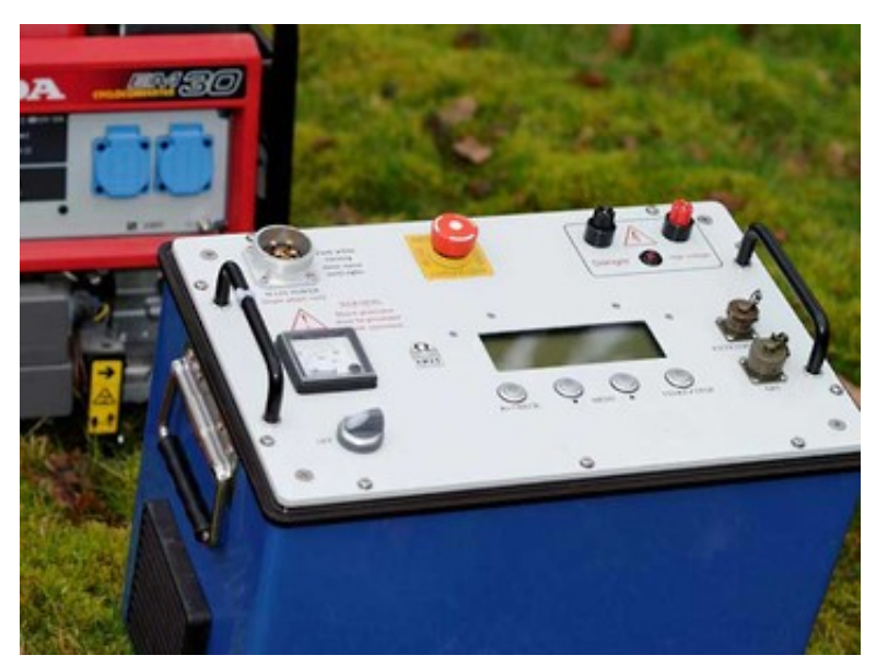
TIPIX 2200 transmitter for resistivity and induced polarisation exploration.

The TIPIX 2200 is a transmitter purposely designed for deep Induced Polarisation (IP) or resistivity sounding investigations. This transmitter is generally used together with V-Fullwavers or Elrec Pro receivers.