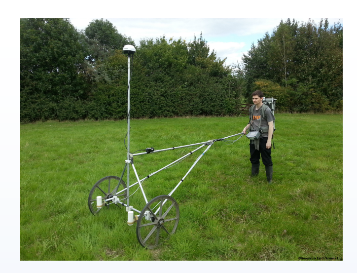
Mag Cart with G-858 gradiometer- sensors are positioned for dual traverse acquisition.