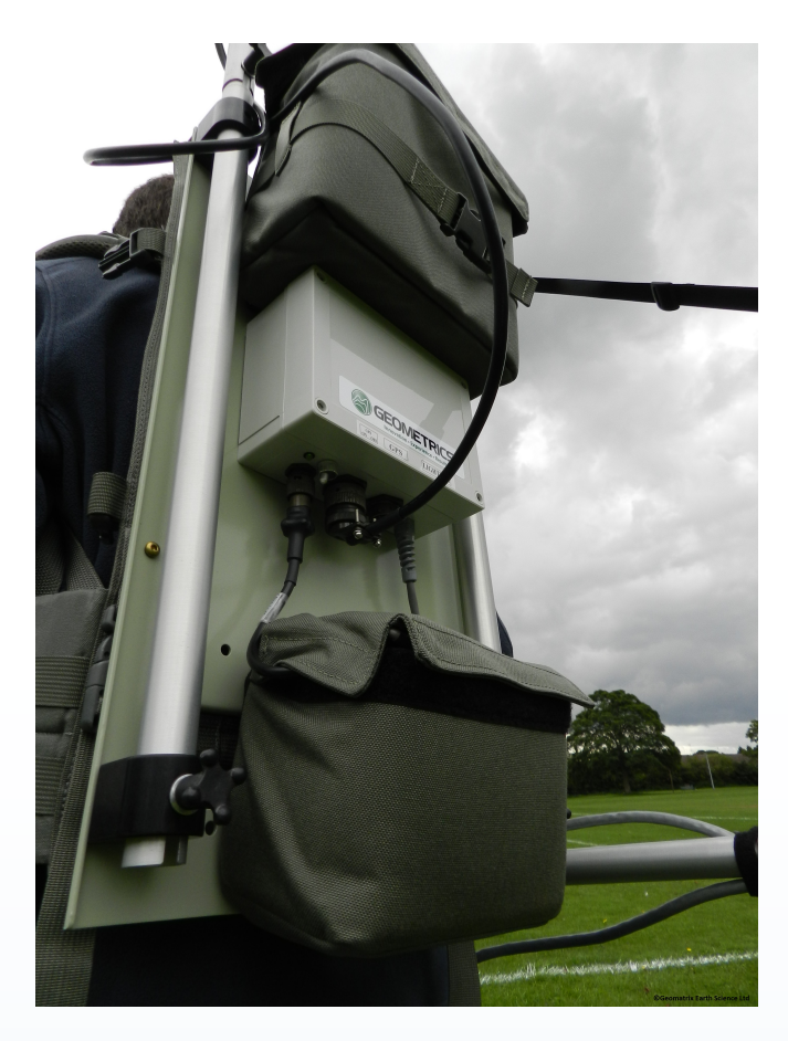
G-858 Backpack, showing battery pouch.