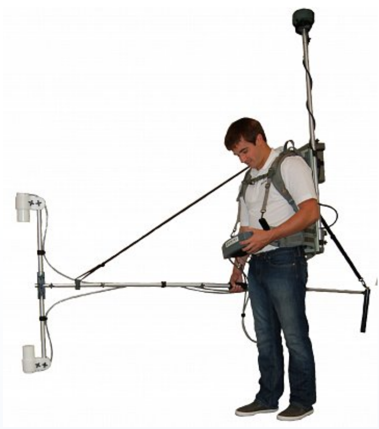
Geometrics G-858 Gradiometer & GPS setup

Portable Caesium Magnetometer/Gradiometer and Professional Magnetic Mapping System the G-858 MagMapper uses a graphical interface to make survey design and data acquisition quick and efficient. Various modes of operation allow the user to custom design a survey grid for their particular needs.