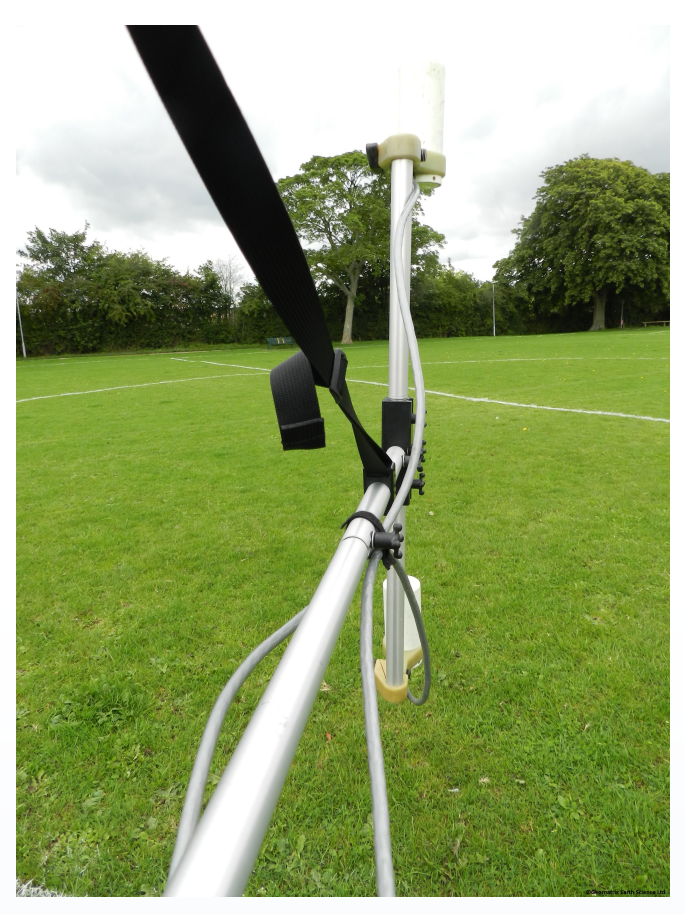
Close up as vertical Gradiometer