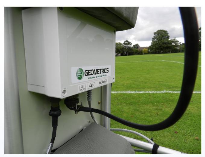
G-858 backpack power and data interface box