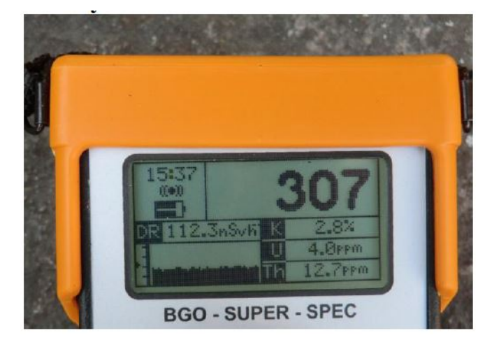
Close-up of GT-32 screen.