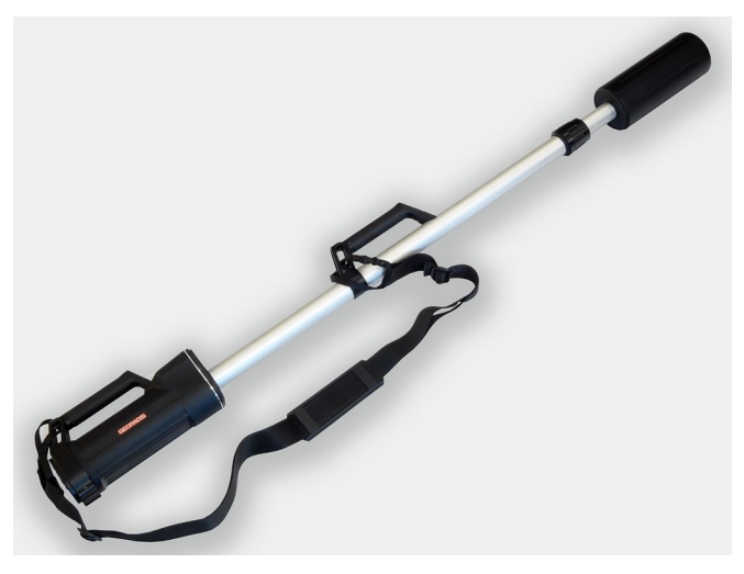
The GT-32 can be supplied with a 2m Telescopic arm to aid analyse difficult to access dykes in rock outcrops.