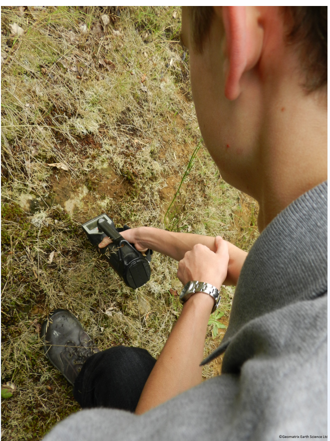
GT-32 measuring natural Gamma count of a rock outcrop.