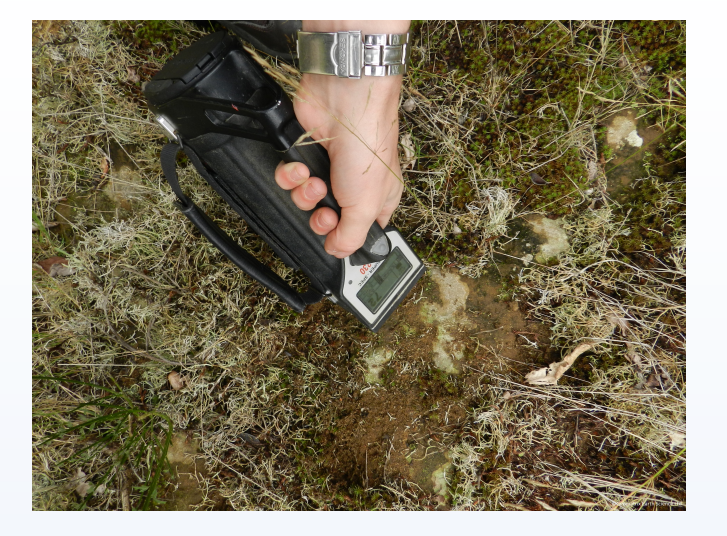
GT-32 performing a assay on a rock outcrop.