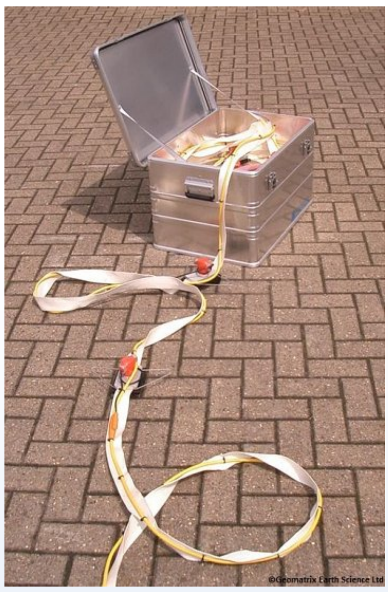
Landstreamer for MASW, 24 4.5Hz geophones at 2m spacings.

Geomatrix Landstremers are based around the L1 kit supplied by GeoStuff. From many years of experience supporting a lease pool of geophysical instruments we understand the lengths needed to produce a rugged and durable landstreamer which can be relied upon. Suitable for MASW, refraction or reflection surveys our land streamers help to improve productivity without compromising data quality.