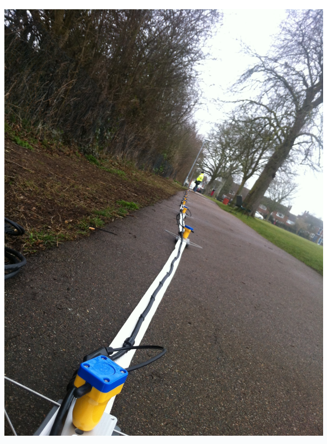
Here is an example of a 48 channel single component landstreamer.