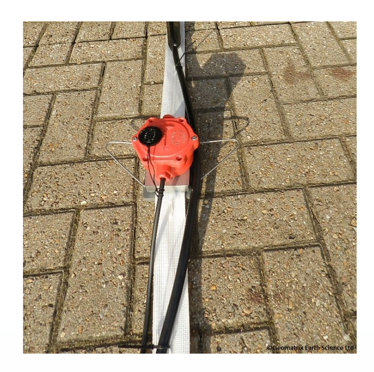
Landstremers with 3 component geophones can be supplied with up to 48 channels.