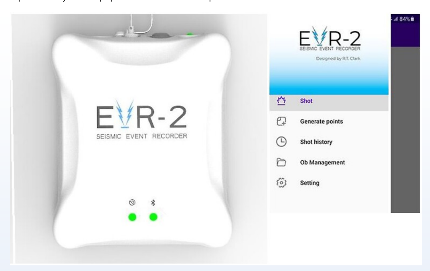
Fig. 1. Image of the EVR-2 Seismic Event Recorder unit and on the right is a screenshot of the Android app interface.

The Real-Time recorded data is saved as an OB.Log file which includes the GPS time stamp, this file can then be exported on to your PC/laptop. The data is also backed up on to the internal TF card.