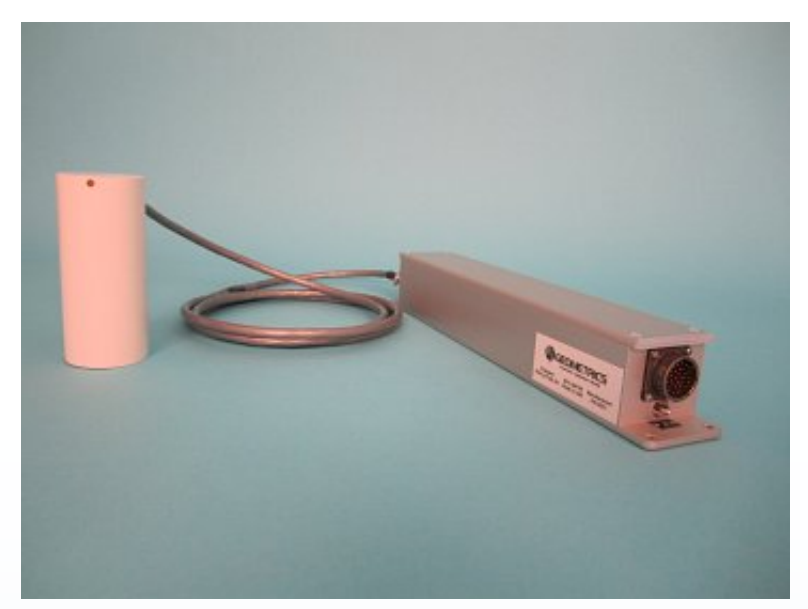
G-824A Caesium vapour magnetometer for high performance airborne surveys.

The Geometrics Model G-824A mates the well-proven high-performance caesium sensor with new sensitive internal sensor driver and Larmor counter electronics. Improved low noise amplifiers have now lowered the noise floor to approximately 350 fT (femto-Telsa). This advanced integrated magnetometer provides unmatched versatility in performance, small size, low weight, wide application range and cost effectiveness