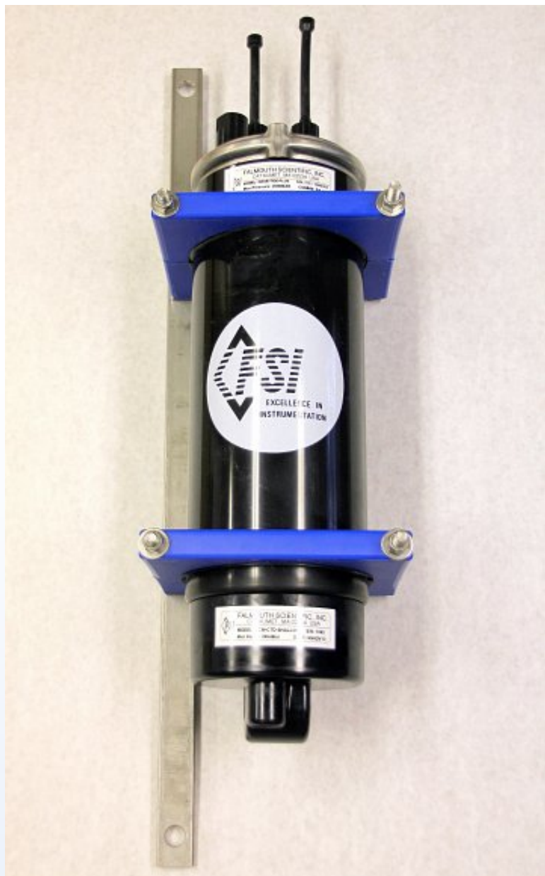
1D Wave and Tide meter with riser clamp assay.

A simple easy to use system with selectable sample rate (1 to 5 Hz), the user to acquire accurate point-spectra of waves. Pressure sensor output can also be integrated to obtain water level measurements unaffected by wave action. With 2 GB of on board flash data memory, the WAVETIDE-PLUS can retain the large amounts of data required for highly detailed wave characterisation.