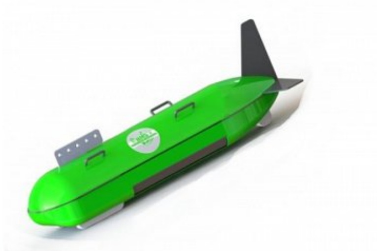
LF and HF Tow Vehicle

Sub-bottom profiling applications in diverse sediments require multiple frequency bands to support diverse survey requirements. The HMS-622 CHIRPceiver and transducer arrays and vehicles fill this wide range of survey needs.