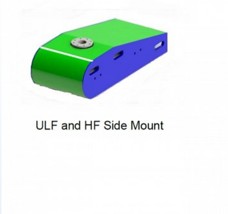
ULF and HF Side Mount

The frequency band supported by the HMS-622 include standard LF (1kHz-10kHz), and optional ULF (200Hz-2kHz) and HF (8kHz-3KHz). It can be easily configured for up to 50kHz with a standard 2 channel transceiver. CW frequencies can also be programmed within the respective band. The transducer and hydrophone arrays are configured to perform both the transmit and the receive functions of the system.