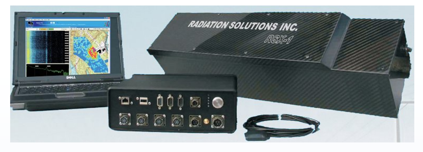
RS700 system with RSX-1 4L Nal gamma detector.

The system is flexible enough to permit real-time monitoring with a computer or operate in a stand alone configuration with the data being recorded internally and later retrieved. Alternatively, the data can be transmitted to a remote monitoring location. The RS-700 utilizes advanced DSP / FPGA* technology and software techniques that provide laboratory levels of spectral performance that were previously unachievable on mobile platforms. Despite it's state-of-the-art technology, the RS-700 is extremely operator friendly and can be rapidly deployed. The system is also capable of unattended operation if required.