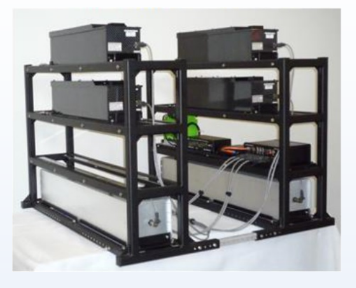
RS700 system with 4 x 4 RSX-1 gamma spectrometers and RSN-4 Neutron detector. This detector configuration permits lateral target discrimination. Image courtesy of Radiation Solutions Inc.

Data quality control and analysis screens offered by RadAssist. Image courtesy of Radiation Solutions Inc.