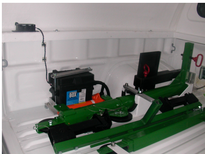
Tow hitch tripod in rear of logging vehicle.