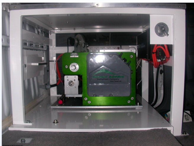
Winch integrated behind the passenger seat of a 4x4 vehicle with inverter for powering the system off the vehicle battery.