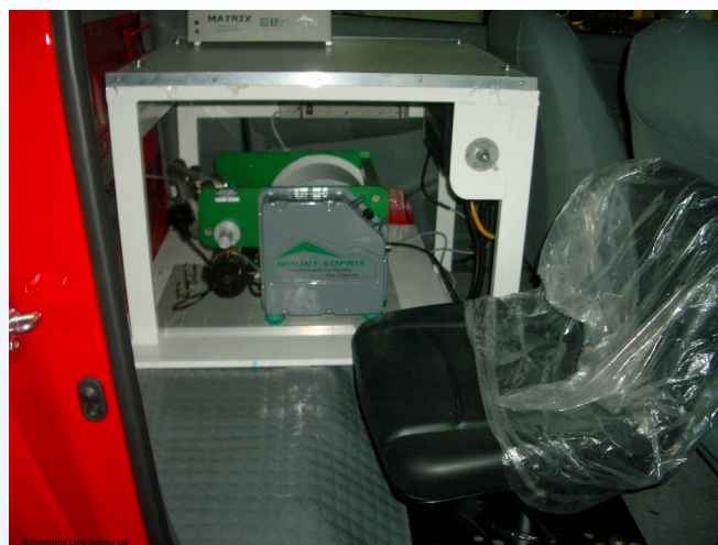
Borehole Logging work station in the back of a Toyota Hilux