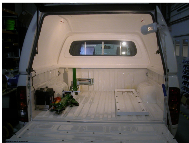
Rear of logging vehicle with integrated winch and probe rack.