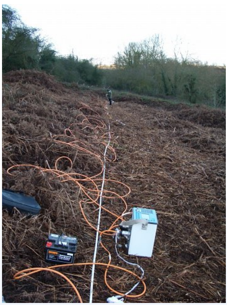
Syscal Pro setup, including external Tx battery.

The Syscal Pro is an all-in-one multinode resistivity imaging system for environmental and engineering geophysical studies. It features internal switching board for 48 (Switch-48) up to 120 (Switch-120) electrodes, 10 of which can be addressed simultaneously depending on the array type being used, and an internal 250W power source.