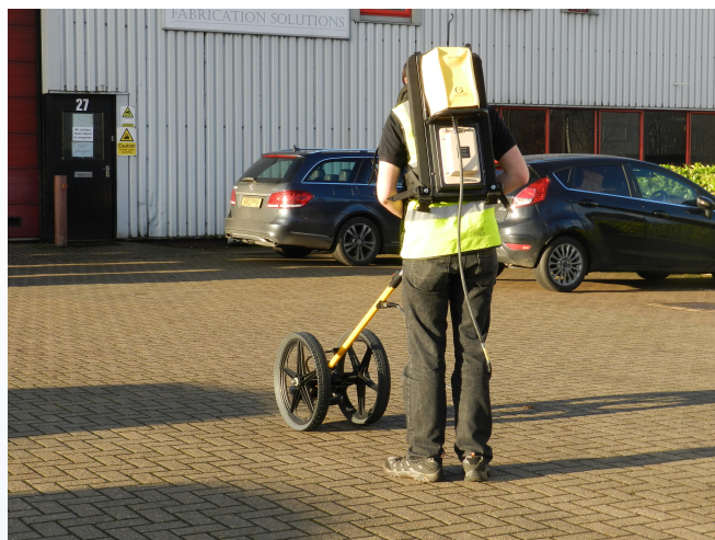
EM61HH MK2 surveying urban site.