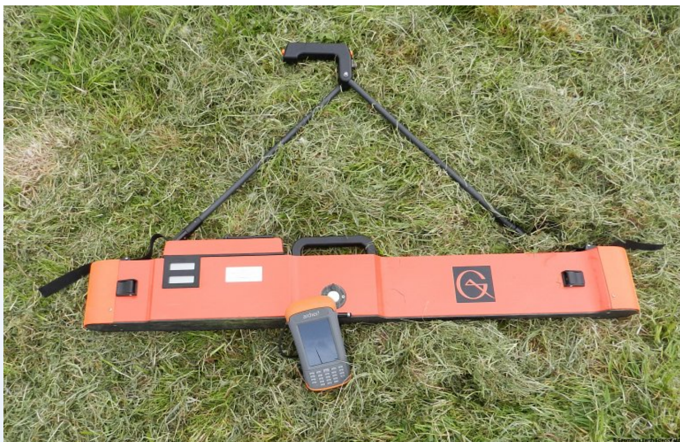
EM38MK2 with ground carry handle.

An optional, collapsible calibration stand supports automation of the instrument calibration.