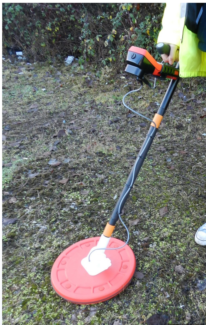
KT 20 3F 32 field loop