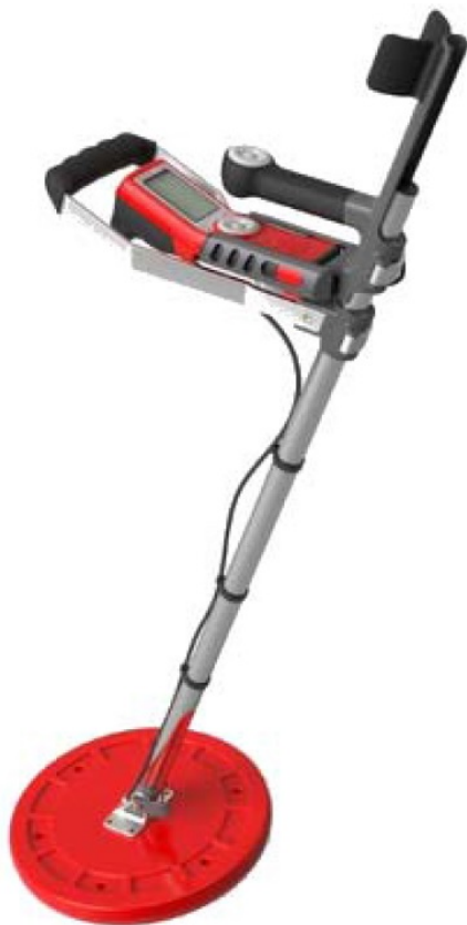
KT20 deployed with 3F-32 ground coil. Ideal for agriculture, archaeology, and environmental investigations.