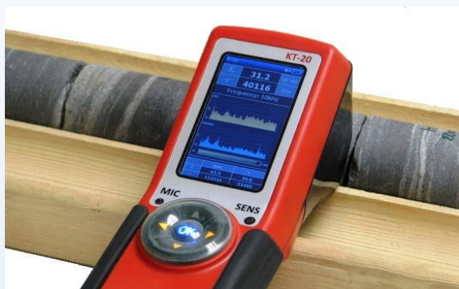
KT20 measuring a core profile.