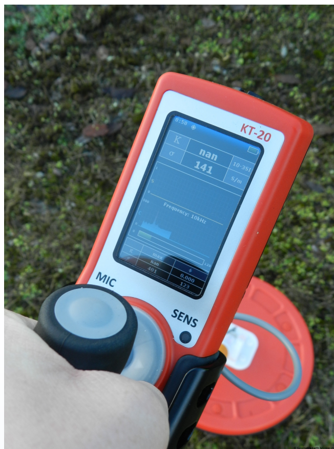
3F 32 Scan mode