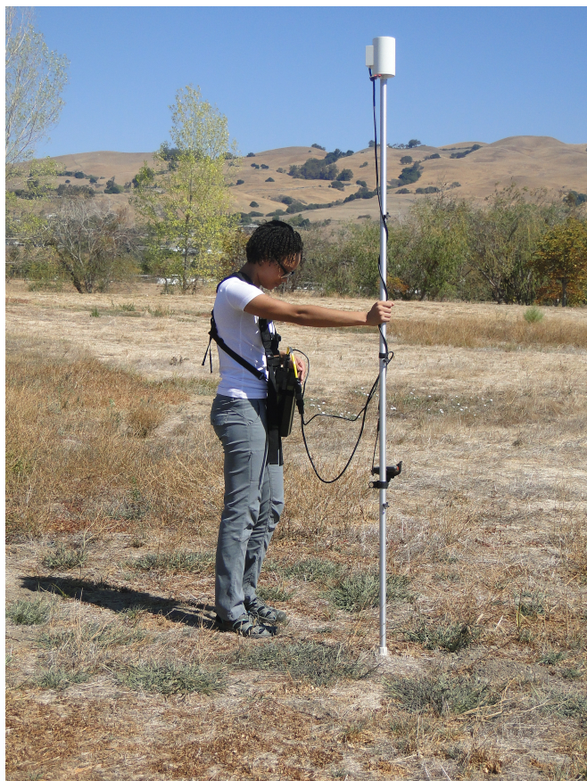
G-857 configured as a roving magnetometer for geological and mineral exploration.