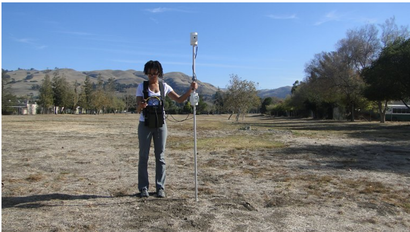
G-857 in use as a gradiometer with integrated GPS.

The G-857 provides a reliable, low cost solution for a variety of magnetic search and mapping applications. Single key stroke operation means the G-857 can be operated by non-technical field personnel or used in teaching environments. The G-857 uses the well-established proton precession method, allowing accurate measurements to be made with virtually no dependence upon variables such as sensor orientation, temperature, or location. The unit provides a repeatable absolute total field magnetic reading. The unit offers new features such as GPS time synchronisation, GPS positions and in-field navigation with a hand held Garmin GPS.