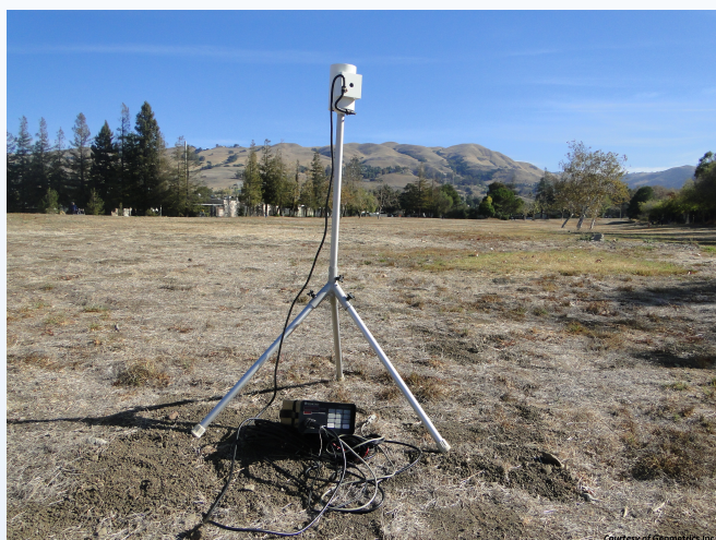
G-857 setup as a base station magnetometer for monitoring diurnal corrections.