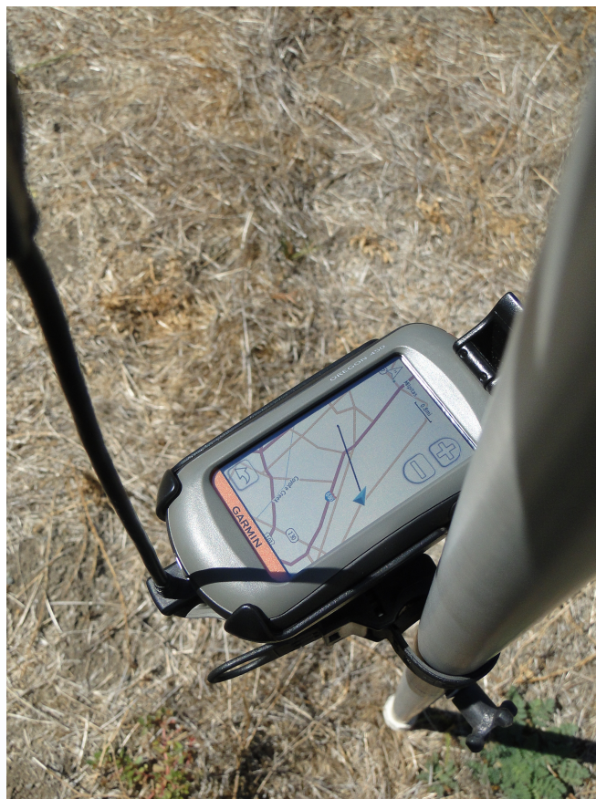
Garmin navigation display.