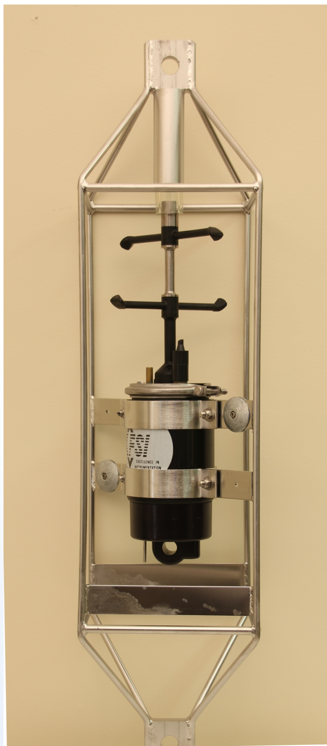
ACM-PLUS with 200m epoxy housing and 5 Ton mooring frame and CTD.