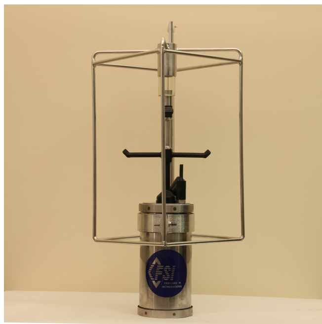
ACM-PLUS with 7000m steel housing and 1.5 Ton mooring frame.