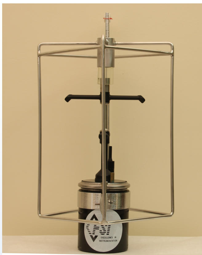
ACM-PLUS with 200m epoxy housing and 1.5 Ton mooring frame.