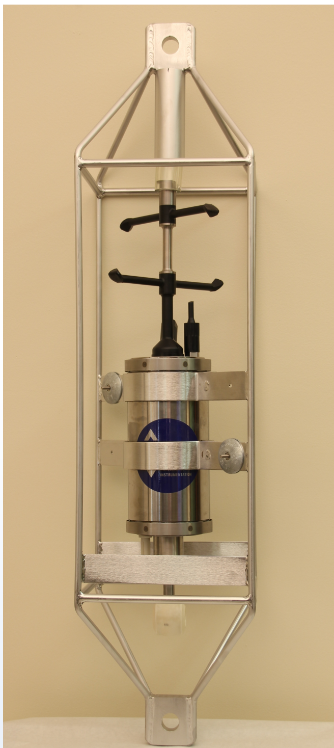
ACM-PLUS with 7000m steel housing and 5 Ton mooring frame and CTD.