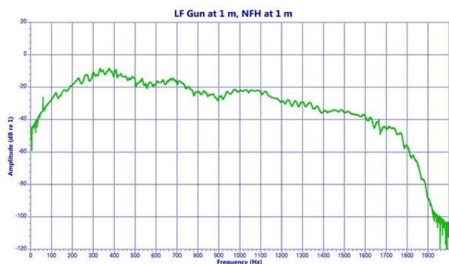
Bubble Pulser LF frequency spectrum