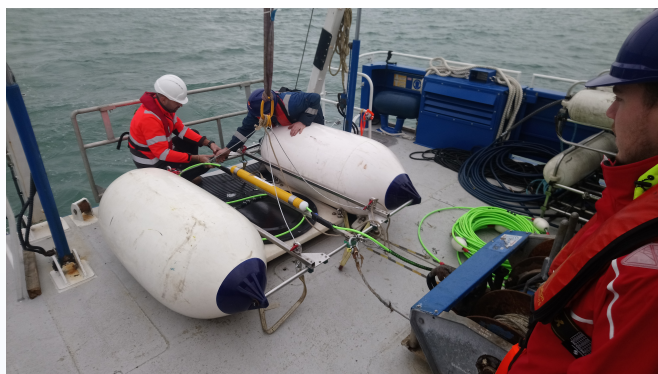
Preparing LF Bubble Pulser seismic source for deployment.