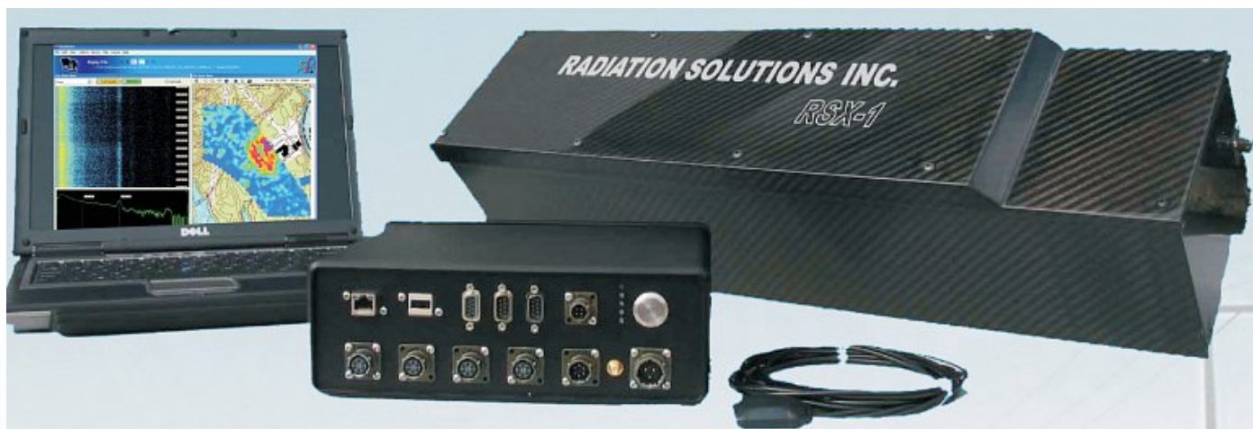
RS700 system with RSX-1 4L NaI gamma detector.

The system is flexible enough to permit real-time monitoring with a computer or operate in a stand alone configuration with the data being recorded internally and later retrieved. Alternatively, the data can be transmitted to a remote monitoring location. The RS-700 utilizes advanced DSP / FPGA* technology and software techniques that provide laboratory levels of spectral performance that were previously unachievable on mobile platforms. Despite it's state-of-the-art technology, the RS-700 is extremely operator friendly and can be rapidly deployed. The system is also capable of unattended operation if required.