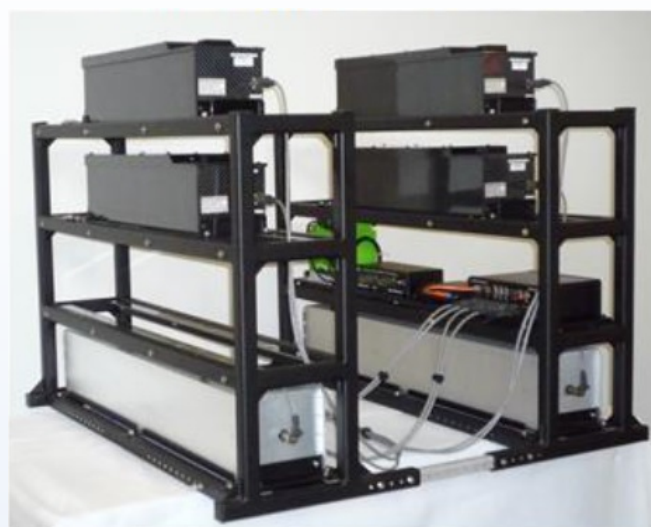
RS700 system with 4 x 4 RSX-1 gamma spectrometers and RSN-4 Neutron detector. This detector configuration permits lateral target discrimination.