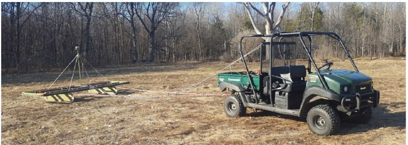
Fig.1. Showing the typical survey set up and tow vehicle arrangement of the EM63 Flex

Ferrous and non-ferrous metallic targets will have a greater response due to the high power of this system enabling the user to detect objects with high precision and enhance the probability of detection. For example, a 60mm mortar shell can be detected to a depth > 95cm and a larger target to a maximum depth of 6m beneath the sensor (depending on the site conditions).