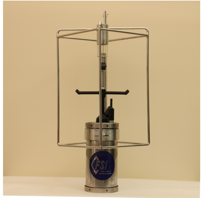
ACM-PLUS with 7000m steel housing and 1.5 Ton mooring frame.