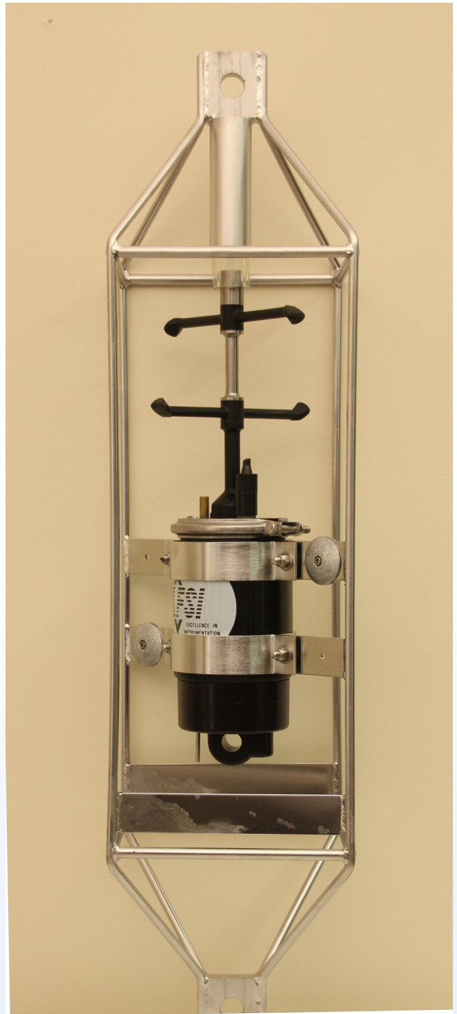
ACM-PLUS with 200m epoxy housing and 5 Ton mooring frame and CTD.